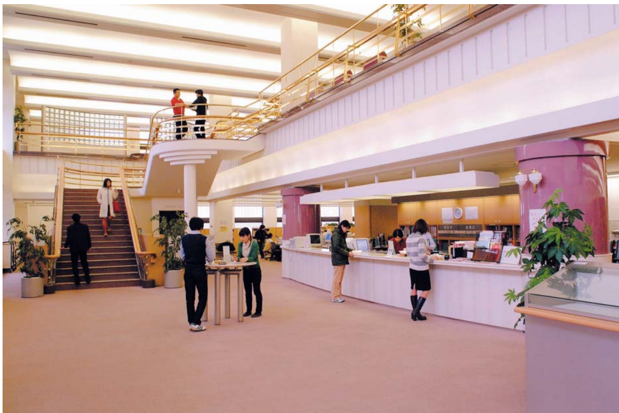
Entrance hall and main counter